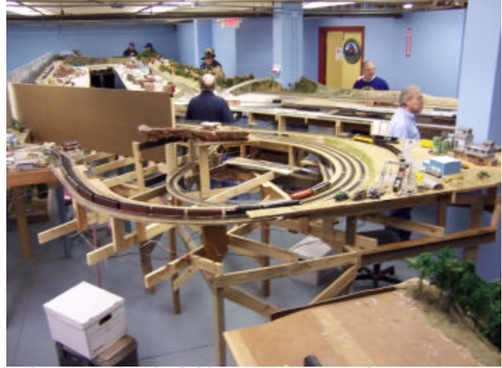
Mifflin County Model Railroad Club Lewistown, PA - December 10, 2005