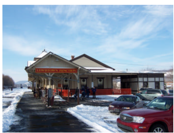
Station at Lewistown, PA – December 10, 2005