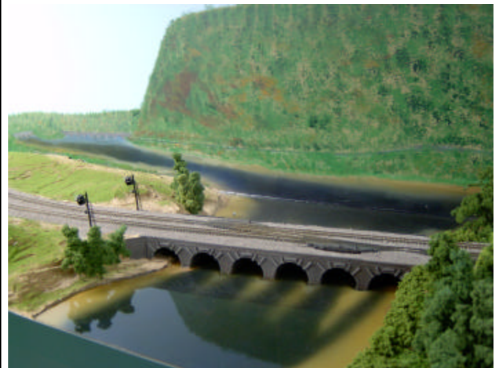
Todd Treaster's N scale model railroad - December 10, 2005