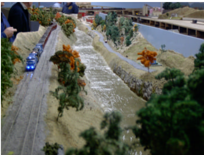
Mifflin County Model Railroad Club Lewistown, PA – December 10, 2005