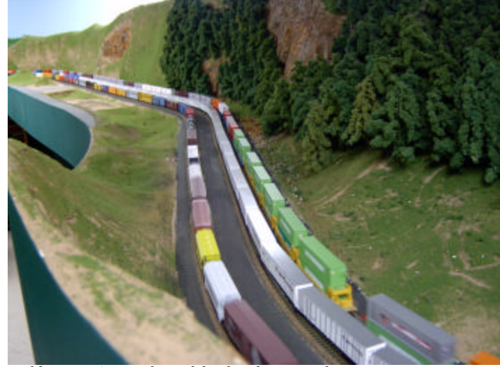
Todd Treaster's N scale model railroad - December 10, 2005