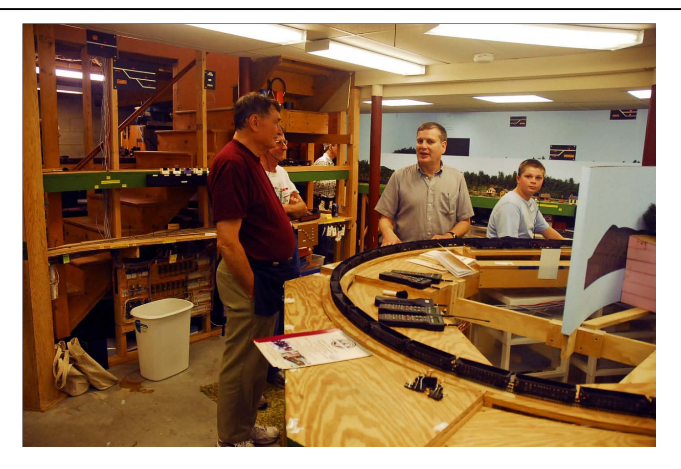
LSOPS at Steven Mallery's PRR Buffalo Line.