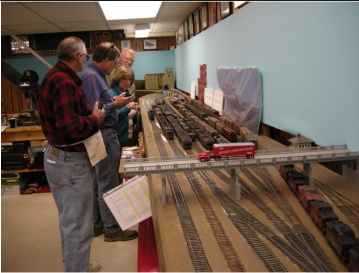
The height of feather-bedding: One moving engine, three firemen at the layout's main Columbia yard.