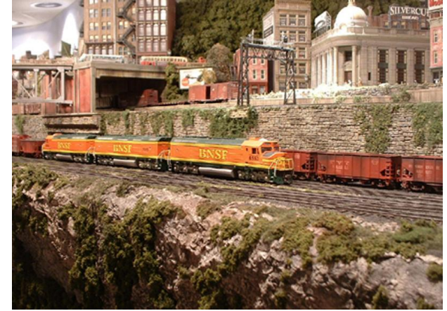
Howard Zane's HO Layout on tour