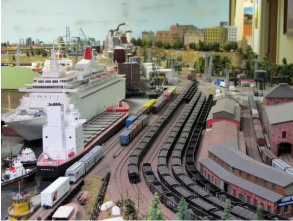
Monroe Stewart's Hooch Junction N Layout on tour