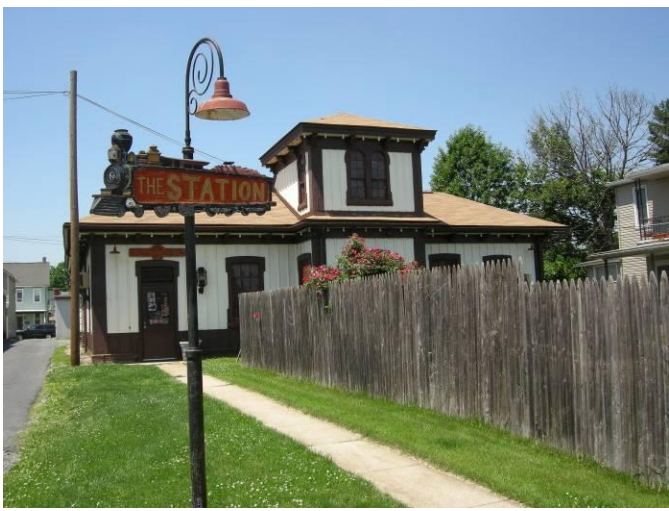
1 – THE STATION – There is parking right down the alley to the left, in back of the store.

Today there is a preponderance of Lionel, Rail King, Williams, Weaver and Atlas merchandise, both sets and individual locomotives and rolling stock. Plasticville and Woodland Scenics kits and RTR bring up