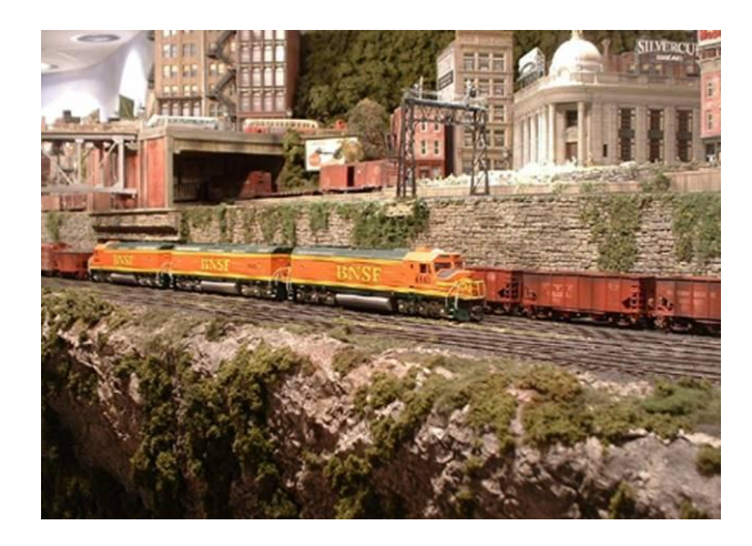
Howard Zane's HO Layout on tour