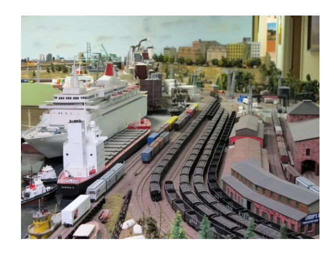
Monroe Stewart's Hooch Junction N Layout on tour