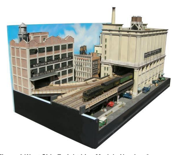
Figure 2 West Side Freight Line Module Number 2

I was hooked. Joe and another friend from the Sunrise Trail Division launched me on a journey that would last 15 years during which I built my well-traveled and noticed New York Central West Side Freight Line modules.