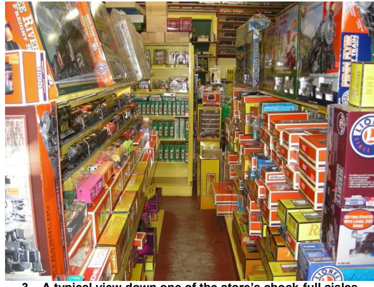
3 - A typical view down one of the store's chock-full aisles.