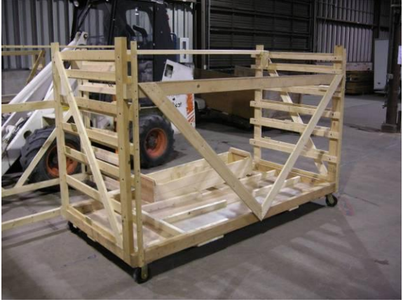
Figure 4 One of the module carrying carts that inspired me - rolling deliciousness

Bob Charles, our AP Chairman quickly blesses the track plan as meeting the Civil AP's requirements and I rush off to the lumber vard. But wait! I am now three hundred years old. My Samson length hair has vacated my head not to mention my depleted strength. My WSFL modules are sitting on their chrome steel shelves, unmoving, as old mothballed battleships. Weight and obsolescence has grounded them. I am immobilized, stymied by the logistics of the situation. I am contemplating six new modules. Though one of the concepts of FREE-MOism is light weight construction I don't look forward to two hours of hand carrying in and out of a show. Besides I don't want to have to buy a used U-Haul box truck to transport the beasts. As I wander the desert of indecision I go by chance to the Railroad Museum of There I see the Reading Pennsylvania. Company Technical and Historical Society's modular club taking down their very large layout. They are using custom made rolling carts and racks that remind me of bakery racks or print drying racks I have seen. The racks, once loaded with their modules, all fit into their fleet of school buses, trailers and vans in a fashion that would have brought envy to the Ringling Brothers or an army general. So I hatch the idea that the castered wheel, 1x3 and 1x4 contraptions might be my transportation solution.