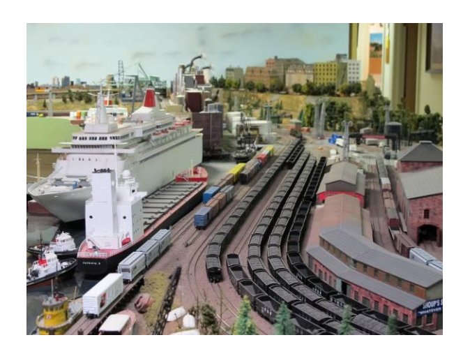
Monroe Stewart's Hooch Junction N Layout on tour