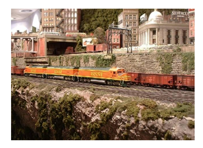
Howard Zane's HO Layout on tour