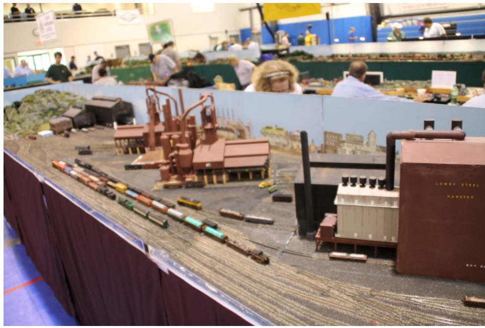
The photo doesn't do justice to this multi-module steel mill, part of the PenNScalers display. It is truly a wonderful scene to behold.

August 22-24 was the 10<sup>th</sup> Annual N Scale Weekend in Bedford, PA. Although not a Division-sponsored event, several Division members attended this show as vendors, shoppers, or module-builders displaying their work (in some cases, all three!) While N-Trak modules have been a staple of this show since the beginning, recently T-Trak modules have made an appearance and the number of those modules increases each year. Attendees come from as far away as New Jersey, upstate New York and central Ohio to run trains, catch up with old friends, and purchase or swap models.