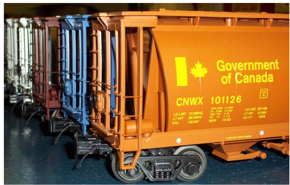
Examples of Weaver's colorful covered hoppers.

We viewed an assembler attaching the trucks to the bottom of flatcars. This led to the discussion of how one model can be painted and lettered for several road names thereby saving on tooling and production costs. This particular flatcar was a trailer train car (TOFC or piggy back car) and gives further variety to the modeler since each flatcar road name could have one of several different highway trailer colors and names. Joe spoke of the risk manufacturers take when they produce a model which is specific to one railroad only. That model cannot be painted and lettered for other railroads and still be prototypically correct. The engine, car or caboose chosen for production must appeal to a significant number of modelers to be financially viable.