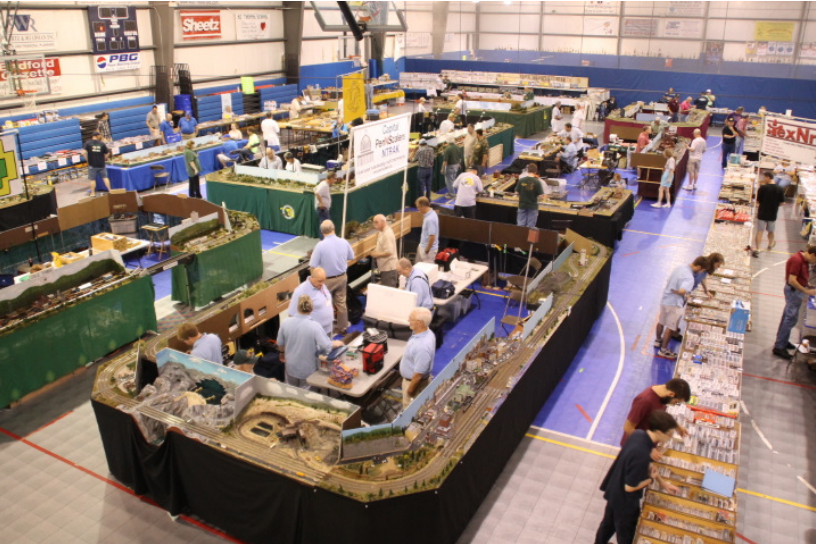
View from the balcony, which also contained a nice layout.