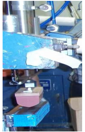
Shown here is a boxcar being pad printed with a road name, car number, or other fine detail.

Owner Lee English hosted the Bowser tour. The tour included a discussion on the state of hobby shops and their role in the model railroading industry. Lee showed how a prototype is selected to become a model for production. He showed us the research, production drawings and technical specifications needed to produce an accurate model. The timeline and effort to bring a model from concept to design, manufacturing, packaging, advertising and final sale was discussed.