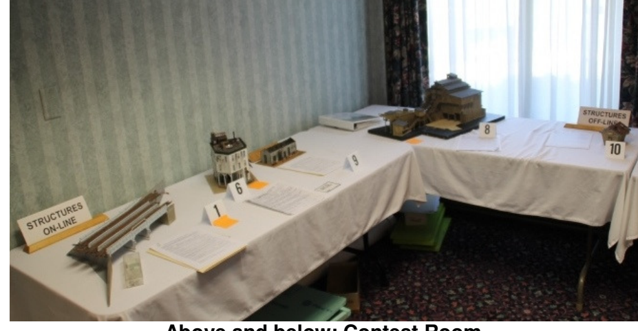
Above and below: Contest Room.