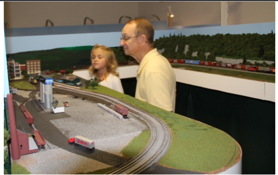
Folks of all ages enjoyed the Open House!

If you or your club is located in our southwestern counties of Adams, Cumberland, Dauphin and York and would like to join the list of participating layouts in 2015, please let me know.