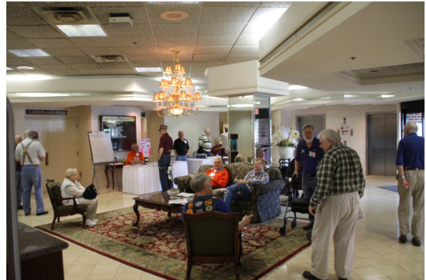
Model Railroaders gather at the convention hotel on Friday morning.

Next years' MER convention will be held in New Jersey, and stay tuned for info on another Mini-Con that will be put on by South Mountain Division in April. There may also be another Mini-Con in the Spring, co-hosted by our neighboring Chesapeake and Potomac Divisions.