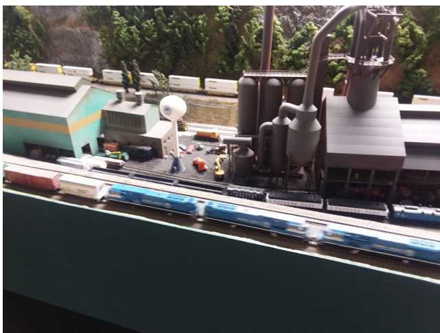
Todd Treaster's Massive N Gauge Layout