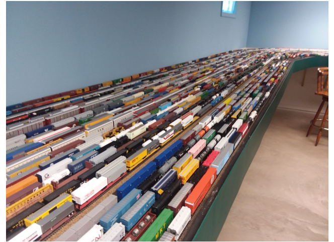
Todd Treaster's Massive N Gauge Layout