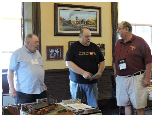
Presentation of donation