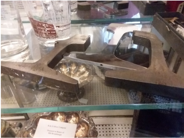
Artifacts in the Lewistown PRR Station