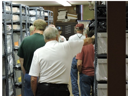
Tour of the Archives