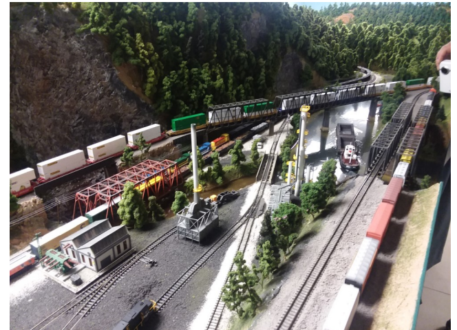
Todd Treaster's Massive N Gauge Layout