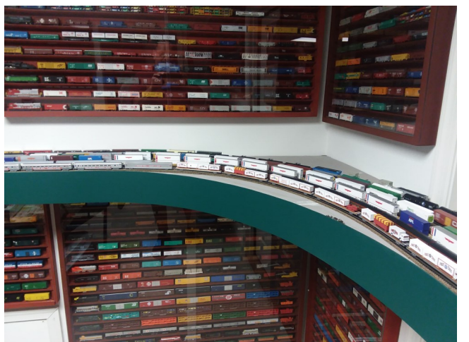
Todd Treaster's Massive N Gauge Layout