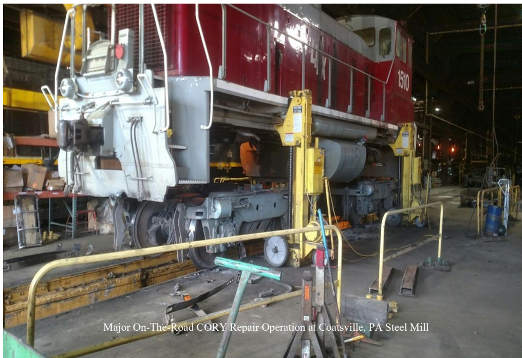
Major On-The-Road CORY Repair Operation at Coatsville, PA Steel Mill