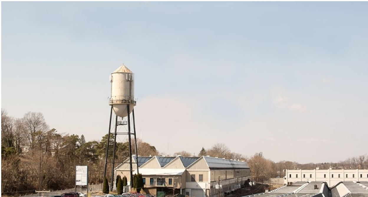
Photo of former Mack Trucks Plant 4A looking west from the 8 th Street Bridge.

AEDC completed renovations to the 60,000 square foot building and in 1989 opened the Bridgeworks Enterprise Center as an incubation program to assist start-up manufacturing companies. More than 60 companies have been through the incubation program with a total of 618 jobs created or retained. Currently there are 11 manufacturers operating in the building that employ more than 50 workers and generate combined annual revenue of $4.66 million. While Plant 4A was not rail served, the adjacent Plant 4 was served by the Reading Railroad. Parking is available in the lot or along Harrison Street, just look for the water tower.