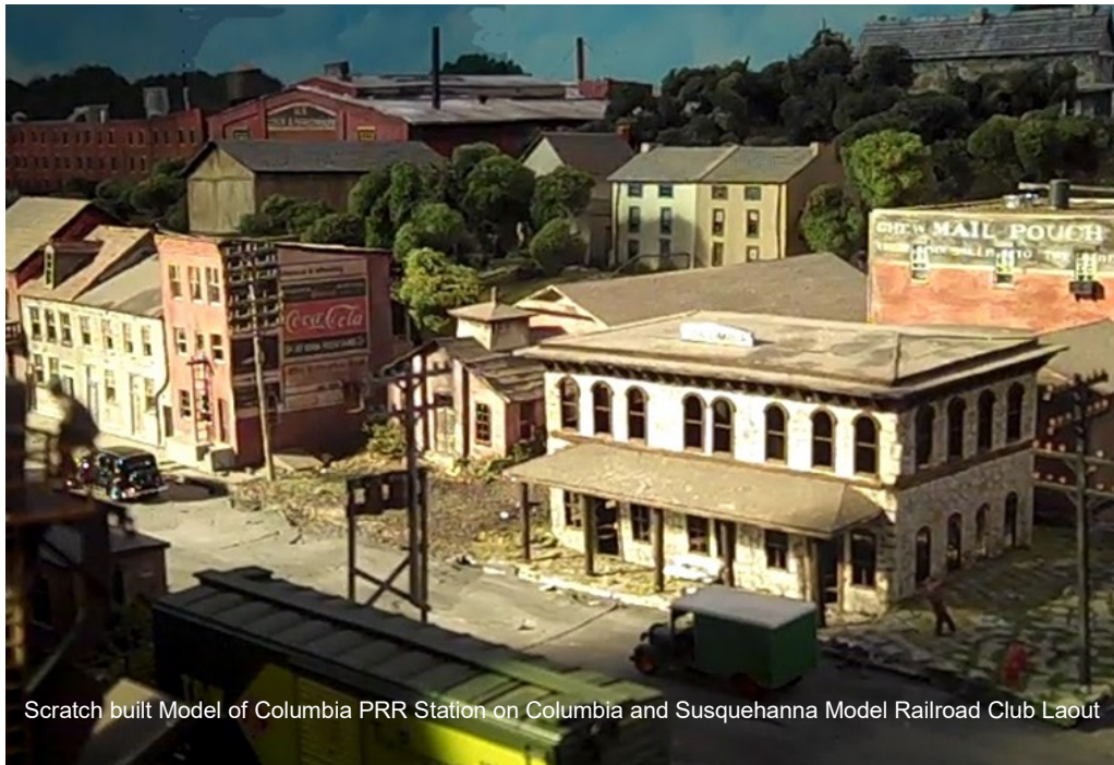
Scratch built Model of Columbia PRR Station on Columbia and Susquehanna Model Railroad Club Layout