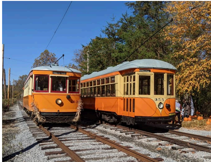
Two of 25 Classic Museum Trolleys