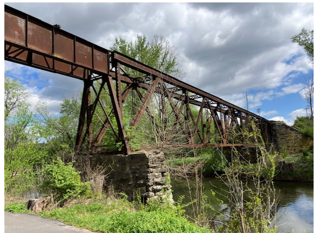
Old Aughwick Bridge Holding Up “March To Saltillo”