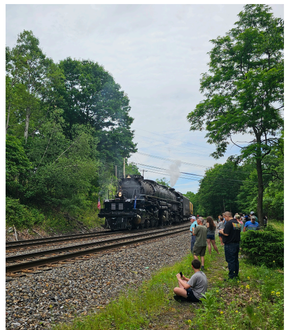
Big Boy No. 4014 -