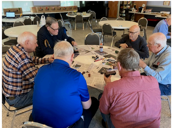
Meeting