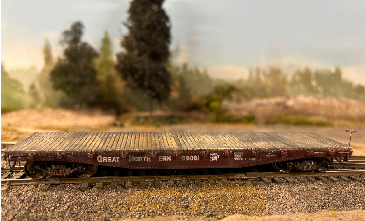
Plastic flatcar deck after weathering

After sharing Tamiya Panel Line Accent Colors at our latest in-person meeting's round tables, I decided to try them out on an HO scale flat car from my stash of cars. My set of standards for rolling stock includes weathering, among others, before I approve it for use on my railroad.